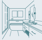
5-Fixture Primary Bathroom