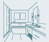
5-Fixture Primary Bathroom