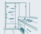
4-Fixture Primary Bathroom